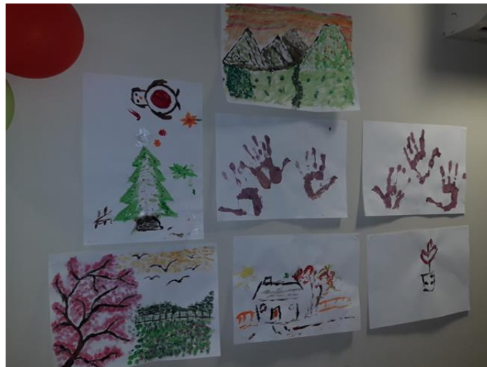
Some examples of our talented resident's art work

The residents enjoyed making a gingerbread house and the ginger bread men to live