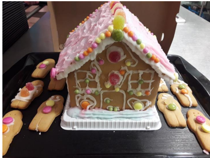
A few pictures of our residents getting in the Christmas spirit

indoors. They had fun making the house, but more fun eating it!